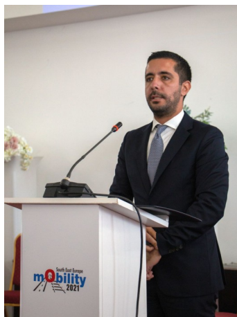
Tomislav Momirović , Minister of construction, transport and infrastructure