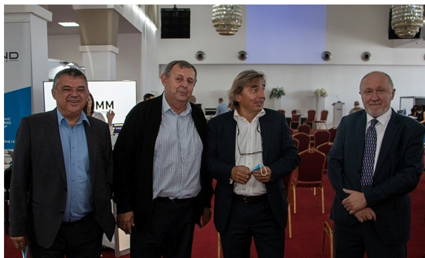
Fair detail: Good mood is always present on the stand of Altpro company from Zagreb.