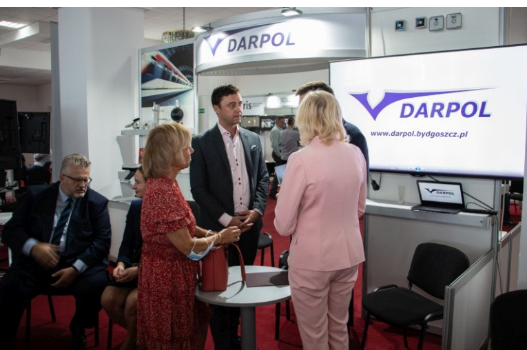
Fair detail: First time the fair Belgrade was attended by a Polish company (Darpol)