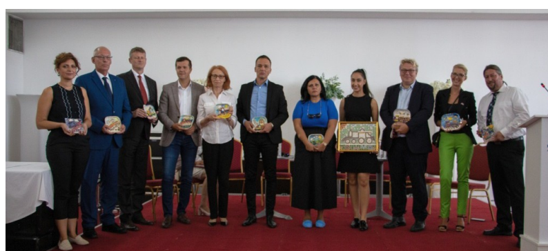
Fair sponsors received handmade artworks as gifts from organizers, RCSEE