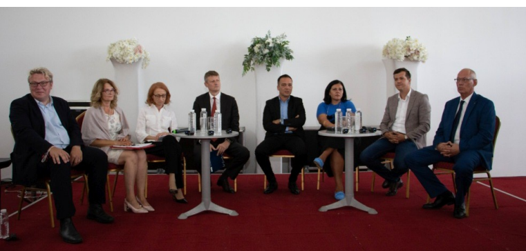
Participants in the fair panel discussion: Railway research, innovations and implementation of new technologies in Southeast Europe region