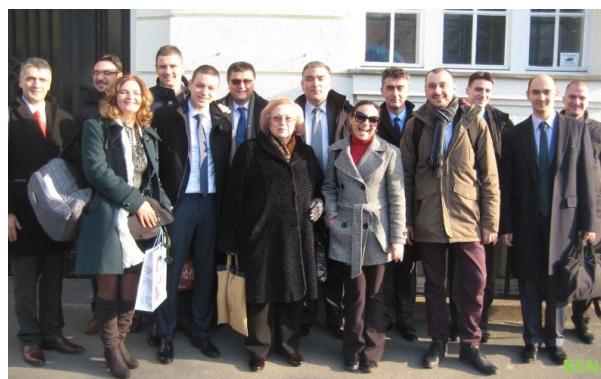
Part of the RCSEE delegation arriving from Serbia