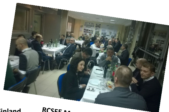
RCSEE Meeting, Detail